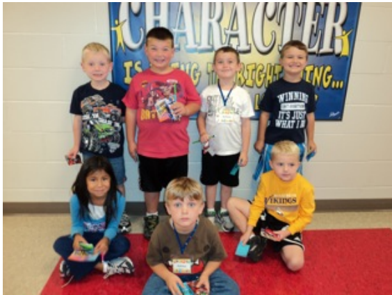
September Kindergarten Birthdays